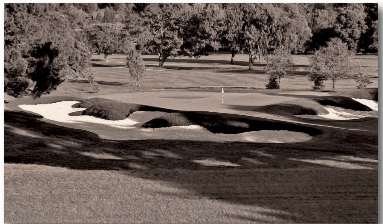
(Above) Peacock Gap Golf Club in San Rafael, California, restored and rebuilt by Forrest Richardson & Associates in 2008