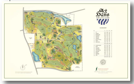
Conceptual plan for the 18-hole S:t Hans layout.