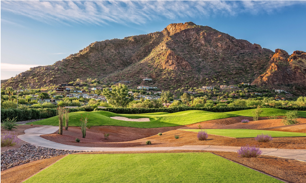
The Short Course at Mountain Shadows — Hole No. 14

Insights, Trends & Examples from Richardson | Danner Golf Course Architects Short Courses